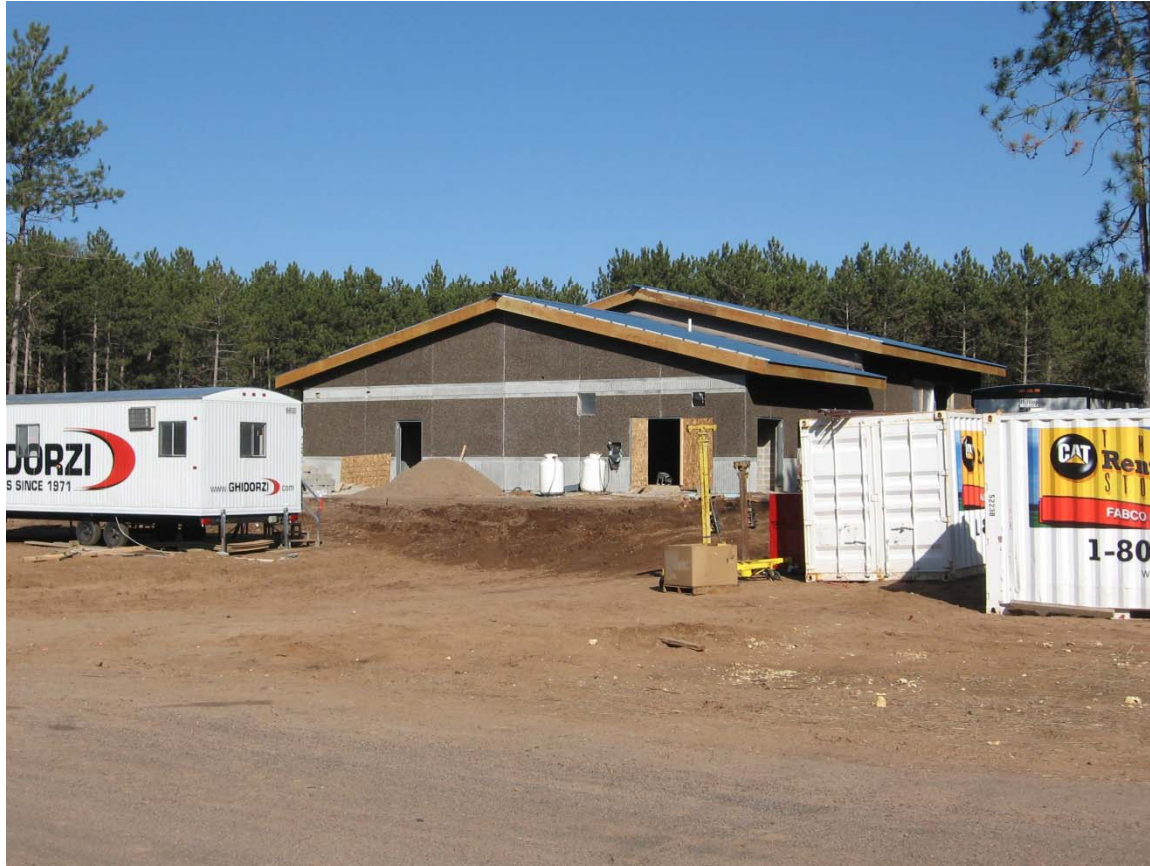
Chippewa Falls Water Treatment Plant