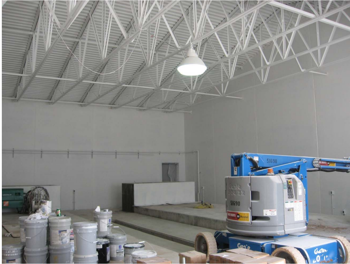
Chippewa Falls Water Treatment Plant