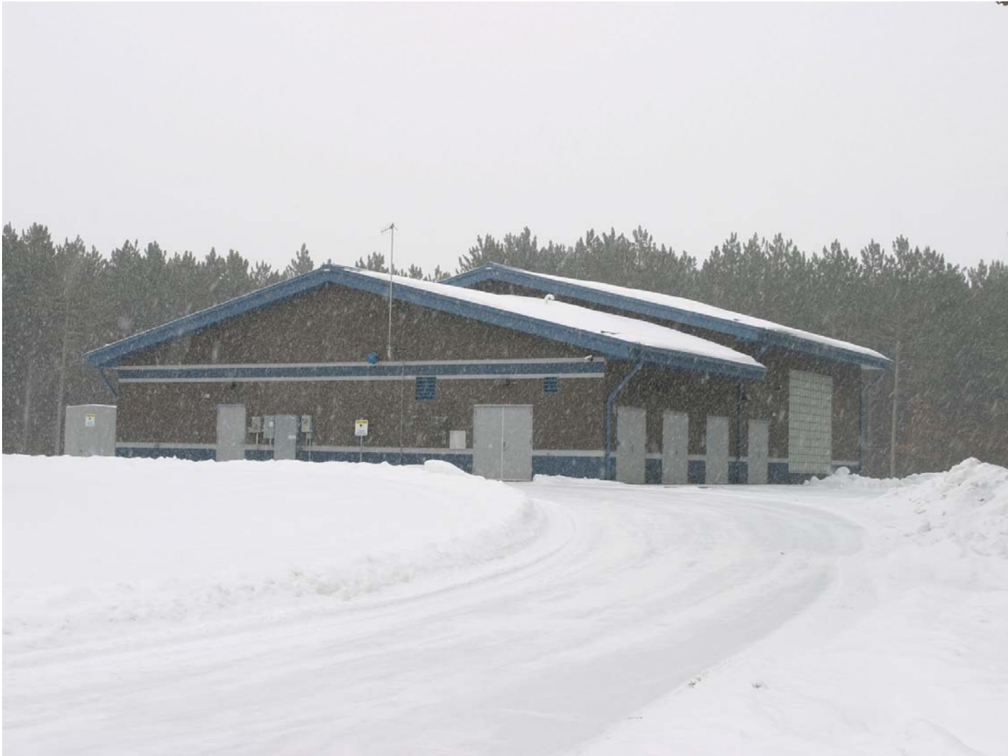
Chippewa Falls Water Treatment Plant