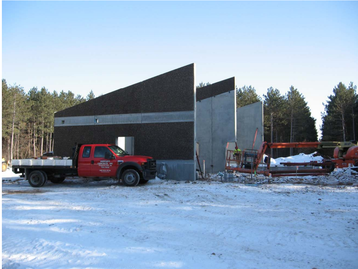
Chippewa Falls Water Treatment Plant