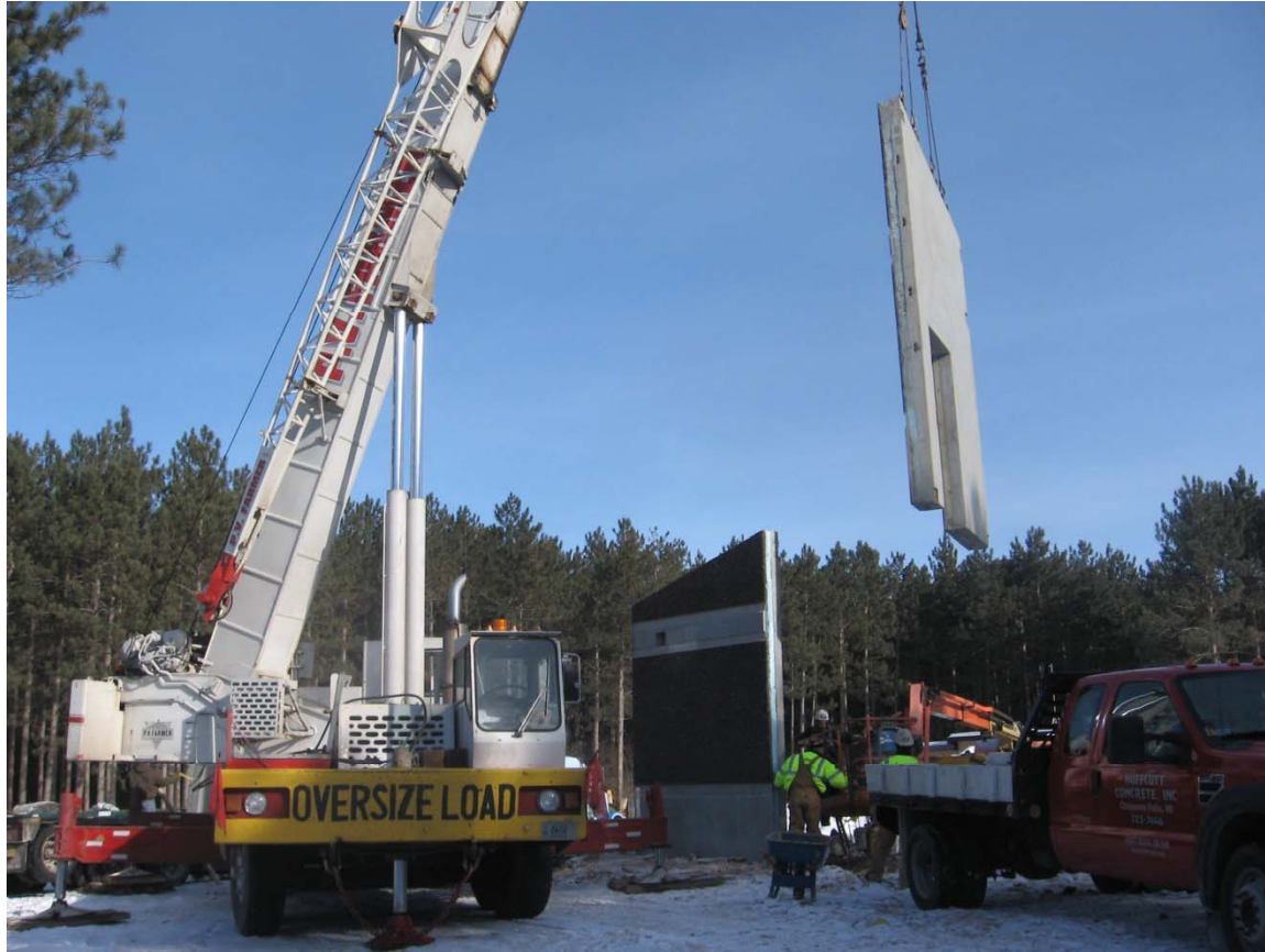
Chippewa Falls Water Treatment Plant