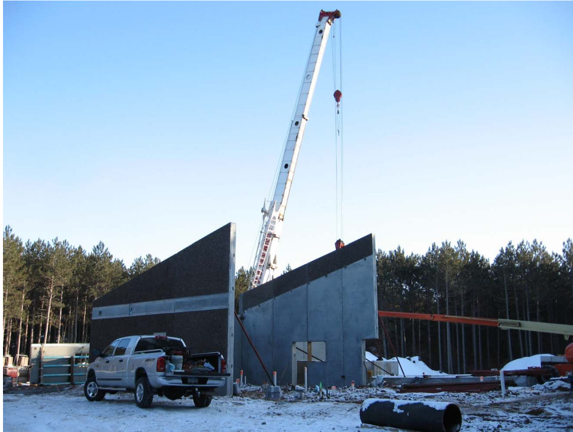
Chippewa Falls Water Treatment Plant