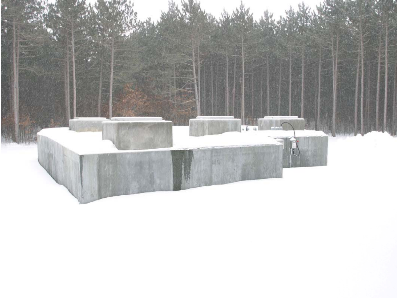
Chippewa Falls Water Treatment Plant