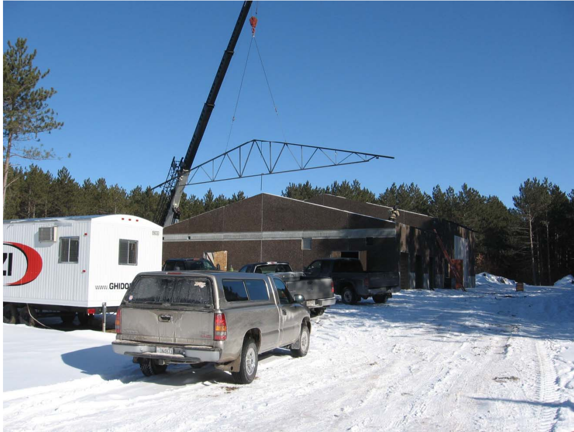
Chippewa Falls Water Treatment Plant