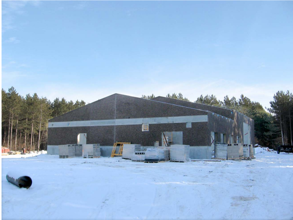
Chippewa Falls Water Treatment Plant