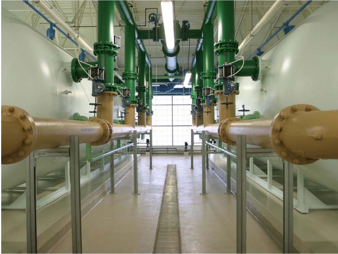
Chemical Feed Equipment